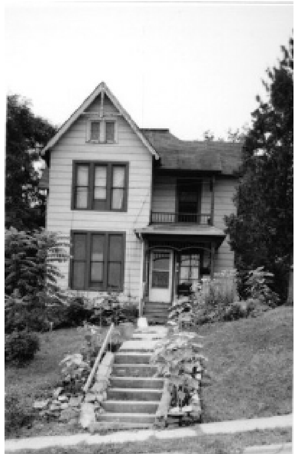
10 FRONT ST. WINN, BEN HOUSE

Additional Information: THIS TWO STORY QUEEN ANNE HOUSE WAS BUILT IN 1893. (SEE BIB. REF. A, G). IT FEATURES AN L-SHAPED PLAN CONFIGURATION, A STONE FOUNDATION, AN ALUMINUM SIDED EXTERIOR, A WOODEN TRIM AND AN ASPHALT SHINGLED HIP AND GABLE ROOF. WOOD ORNAMENTATION EMBELLISHES THE STREET-FACING OPEN GABLE END, A FRONT PORTICO AND A BALCONY. THE RESIDENCE IS IN GOOD CONDITION.