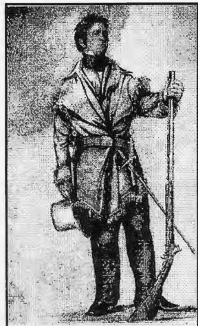
Col. Henry Dodge 1834 by George Catlin