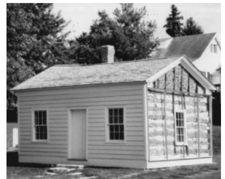
The interpretation left the west side exposed so people can see the construction methods used.