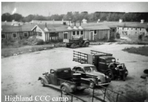
Highland CCC camp

Come hear Don McGuire speak about the Highland CCC camp.