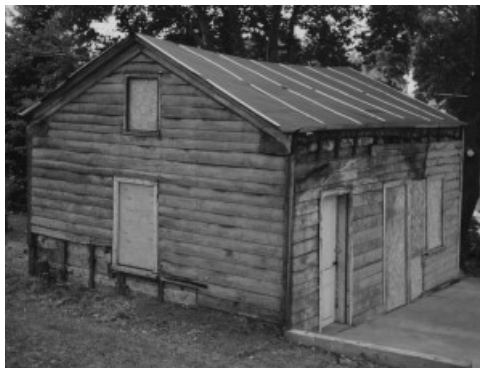
Cabin before its last move

This interpretation demonstrates the evolution of a log cabin constructed in 1827 into a family home with clapboard siding, plastered walls, wallpaper, a brick chimney, and numerous wood frame additions, since removed. The interpretative period starts with the 1827 log construction which is protected but visible on the west side of the building while the other three sides are restored to the time of the original upgrading with clapboard siding between 1840 and 1850. The use of authentic unbeveled pine boards as siding demonstrates, as do the logs, the use of that building material which was most readily available when the need for shelter arose. The logging visible in the upper west gable end is believed to have been installed in the period 1830 to 1840. The chimney is restored and samples of the hand split accordion lath, plaster, and wallpaper are also visible to the visitor. In this small cabin, the story of human habitation in the Lead Region of Southwest Wisconsin is interpreted and brought to reality as living history.